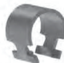
1029C RETAINER COVER