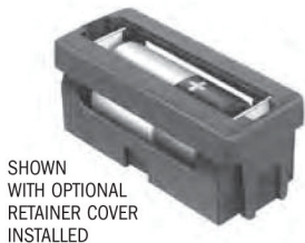
SHOWN WITH OPTIONAL RETAINER COVER INSTALLED