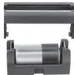
108C, 1028C & 1029LC RETAINER COVER