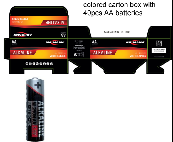
colored carton box with 40pcs AA batteries

40pcs. Box dimensions: 148 x 62 x 52 mm weight (incl. batteries): 945 ± 30 g