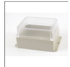
Some models supplied with deep lids.