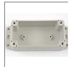
Internal DIN rail mounting point.