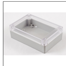
Clear Lid (polycarbonate version shown)