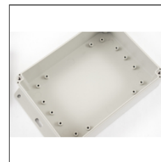
Internal mounting points for PC boards or panels