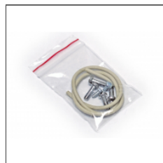
Hardware includes lid screws, PC board screws, and gasket