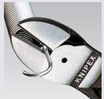
Induction hardened precision blades also suitable for piano wire