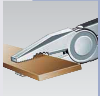
Gripping zone for flat material