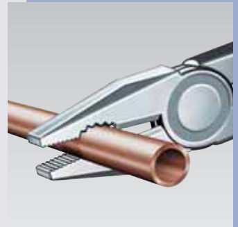
Gripping zone for round material