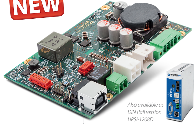
Also available as DIN Rail version UPSI-1208D