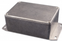
Spot-welded bottom flange