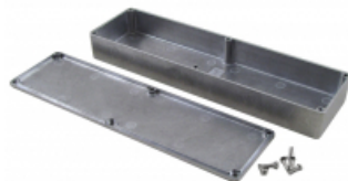
Lap joint construction where lid and box meet.