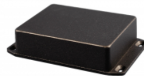
Wall-mounting flange integrated into lid.